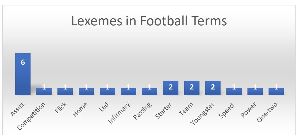
Table 1: Lexemes of Football Register

This study found the 46 data of the register on online media of "BOLA" magazine. In this study, the data will be broken into two types of analysis, namely grammatical features and contextual meaning. The grammatical features of the data consist of lexemes and phrases. On the other hand, the contextual meaning of the registers used in the football news will be discussed in this study. Therefore, the data sets were analyzed systematically based on the grammatical features, particularly lexemes and phrases.