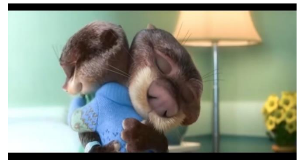
Figure 4.11. Zootopia movie, 2016; (01;31;34)

Mrs. Otterton asks Judy to find her husband and it became what The Hero lacks. When Judy finally finds Mr. Otterton that has been missing it becomes the prize or The Princess in the Zootopia movie. The Princess is not always a woman and in fact The Princess is not always human, The Princess is whatever The Hero lacks.