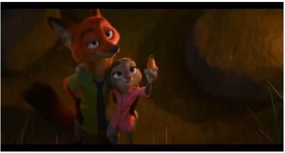
Figure 4.9. Zootopia movie, 2016;(01;30;48)