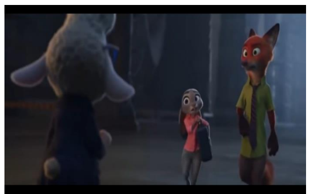
Figure 4.2. Zootopia movie, 2016; (01;26;55)