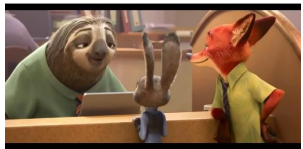
Figure 4.8. Zootopia movie, 2016; (00;40;35)