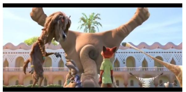
Figure 4.7. Zootopia movie, 2016; (00;37;59)

Judy: Uh.You didn't happen to catch. the license plate number, did you?