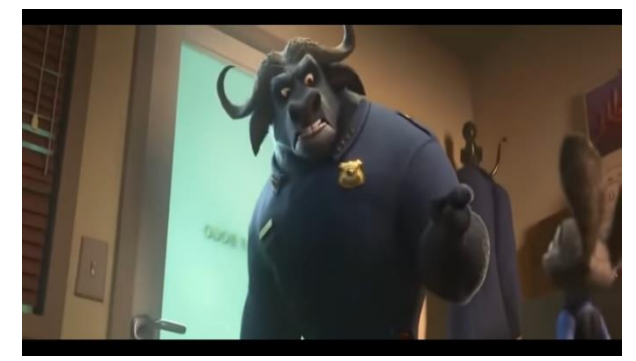
Figure 4.12. Zootopia movie, 2016;(00;31;56)