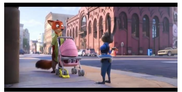
Figure 4.5. Zootopia movie, 2016; (00;34;50)

Judy :"Hi! Hello? It's me, again! No. Actually, it's Officer Hopps. and I'm here to ask you some questions about a case. This is important, sir. I think your $10 worth of popsicles can wait. Please, just look at the picture. You sold Mr. Otterton that Popsicle, right? Do you know him? Fine. Then we'll have to do this the hard way. Nicholas Wilde, you are under arrest. Felony Tax Evasion. I mean, I am just a dumb bunny. but we