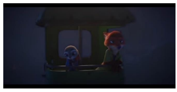
Figure 4.4. Zootopia movie, 2016; (00;56;36)

Nick : "Never let them see that they get to you. No, I mean, not anymore... but Iwas small... and emotionally unbalancedlike you