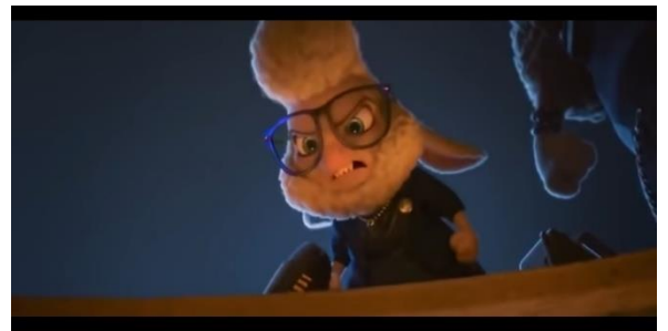
Figure 4.3. Zootopia movie, 2016; (01;28;49)