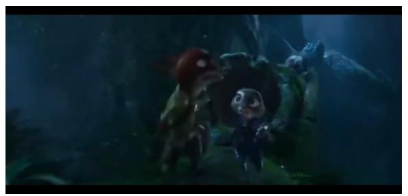
Figure 4.3. Zootopia movie, 2016; (00;52;37)

From the explanation and the scene above, the researcher concludes that Manchas also fulfill the constinuent of a Villain in the Zootopia Movie.Chasing and attacking Nick and Judy are the action shows in the movie that Manchas also The Villain of the story.