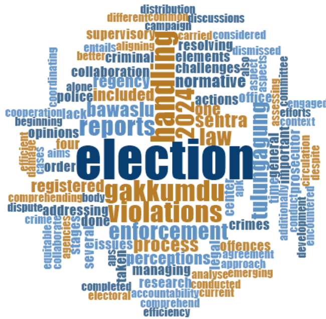
Figure 1. Word Cloud Gakkumdu

There are two types of reports: (1) Not Registered: four (4) cases; (2) Registered: one (1) case, with details as follows: Unregistered, Alleged Reports include (a) Non-transparency of the Karangrejo Sub-district Panwaslu in the recruitment process for the formation of PPK, PPS and KPPS PEMILU; (b) Distribution of basic necessities to vote by PDI Perjuangan candidates with serial number 3; (c) Destruction of Campaign Props (APK) and Socialization Props (APS) of PDI Perjuangan ; (d) Circulation of Tabloid Indonesia Maju which is prohibited by Bawaslu; Alleged Report Registered (e) Circulation of Videos to the Tulungagung Bawaslu Staff regarding his Non-neutrality as a Village Head supporting one of the Paslon. Violations are reports submitted by various parties, including Indonesian citizens who have the right to vote, election participants, or election observers, to Bawaslu, Regency / City Bawaslu, Sub-district Panwaslu, Village / Village Panwaslu, Overseas Panwaslu, and / or TPS Supervisors.